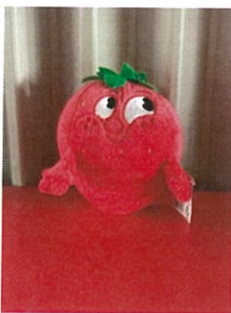
Sunny Strawberry KP

The aim of the Moving Munchies is to encourage your child to eat many different fruit and vegetables throughout different parts of the day. This can include at breakfast time, as a snack or during lunch or dinner! There is no limit to how many fruits and/or vegetables can be eaten throughout the day!