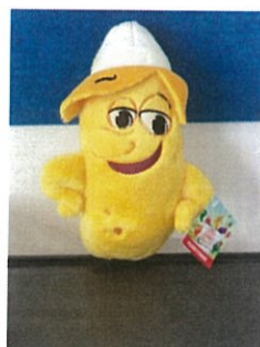
Billy Banana KGZ